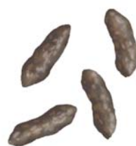
Rattus rattus droppings