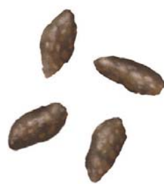
Rattus norvegicus droppings